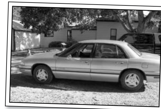
1997 Buick Lesabre Custom, 4 door, V-6, automatic, engine has 82K miles